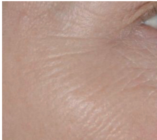
Fig. 2a: Before the IPL/boswellia treatment