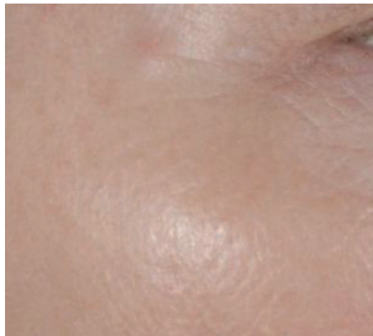
Fig. 2b: After the IPL/boswellia treatment