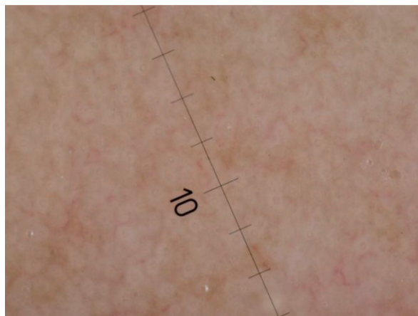
Fig. 3b: Barrier disorder after the treatment

The condition of the skin before and after the treatment has been photo documented and a dermatoscopy (with 10 x magnification) was carried out. In addition, the visual appearance of the skin was evaluated with a magnifying glass according to current dermato-cosmetic criteria. Before and after the respective treatments the test persons were asked to subjectively assess their skin through a mirror.